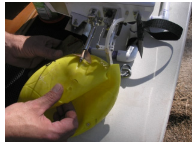
CSI ----- proof positive match

Note: the other suspect has the same boat as the first. And is not pictured here on this page. Look at page 1.