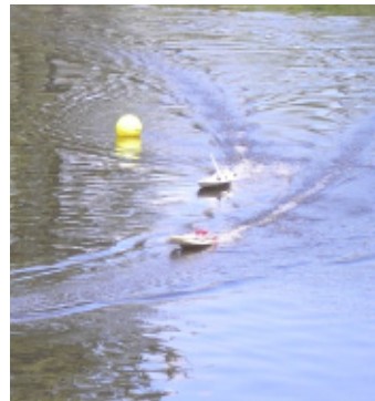
Cracker box racing