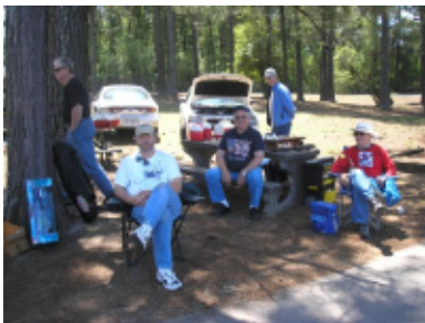
Guys hanging out

We had most all aspects of rc boats to show up this meeting.