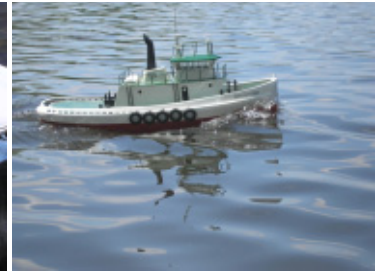
John Antonides Harbor Tug makes an impressive appearance on the water.