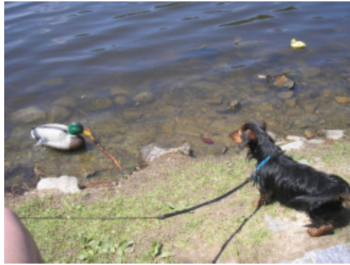
.. "Ruff, Ruff can I eat your duck? "