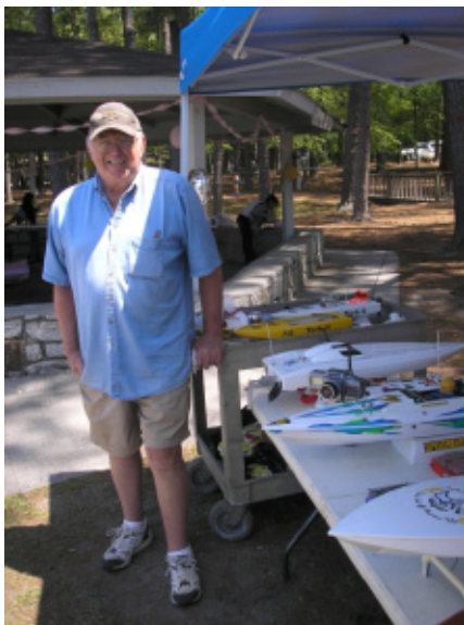
Buoy Basher #1 suspect

The CSI team was called upon after the club meeting. Unfortunately we had a perpetrator that did some inexpectable acts to our fine outstanding racing buoys. The suspects, who will remain unnamed, are currently at large. However, the CSI team retrieved the evidence, and has made positive identification of which boats caused the damage. Yes there were two. Which complicated matters. The rookie racers have been indited and are now officially called Buoy Basher.