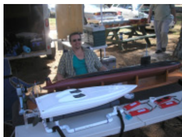
Rick's table of boats.