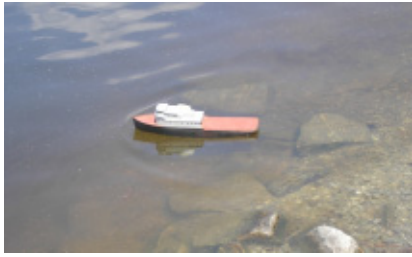
Matt's new mini Tug