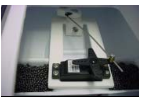
Attach the Barge Catch Assembly with the stainless steel mounting screw. Tighten the screw gently, only until it is snug. The Barge Catch Assembly is now installed.

Install the Barge Magnet into your barge as close to the surface of the stern of the barge as possible. Place the height of the Barge Magnet to match the height of the Towboat's Barge Catch Magnet when both are in the water at their proper waterline. Make sure the Barge Magnet is oriented to be attracted to the Towboat when the Barge Catch Assembly is in the CATCH position. Properly installed, the Barge Catch Assembly will help hold your Vac-U-Tow Towboat against your Barge during most maneuvering. Waves or windy chop may cause the towboat and barge to separate. Additional magnets stacked onto the Barge Magnet will strengthen the magnetic bond, as long as the Servo is strong enough to rotate the Head of the Barge to release properly.