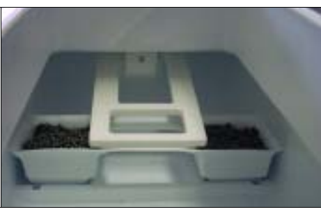
Set and center the front ballast tray and the Barge Catch assembly in place on the Hull Liner's mounting shelf as shown. Mark the mounting hole location with a pencil.