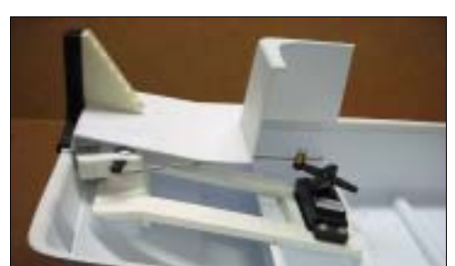
The pushrod will have a slight angle To fit, the Barge Catch Assembly must be slid into the bow of the Towboat along with the Front Ballast Tray. The installation will resemble this cut-a-way photo.