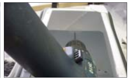
Remove the Barge Catch assembly. Drill a 1/8-inch hole in the hull liner for the mounting screw. Drill only through the liner, not the hull!

Install a standard Servo as above. Connect it to your radio gear, turn the servo control counter-clockwise. Adjust the EZ-Connector so the Head of the Barge Catch assembly points forward, and the Servo Arm is oriented exactly as shown. This is the CATCH position.