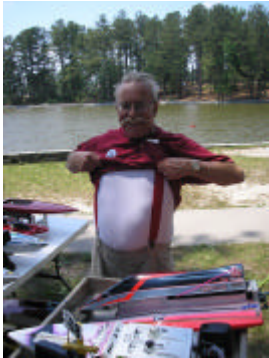
Ray's Secret Power Suspenders