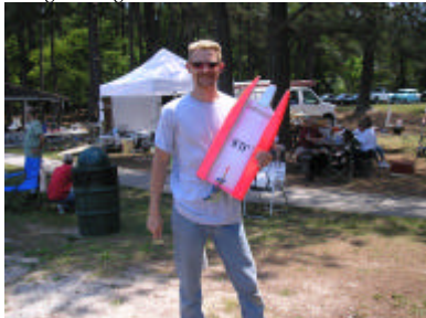
Way to Flip and lose the Batteries