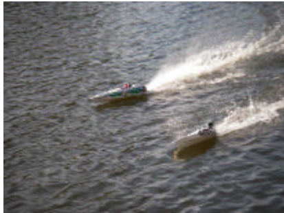
Bobber Attack Formation